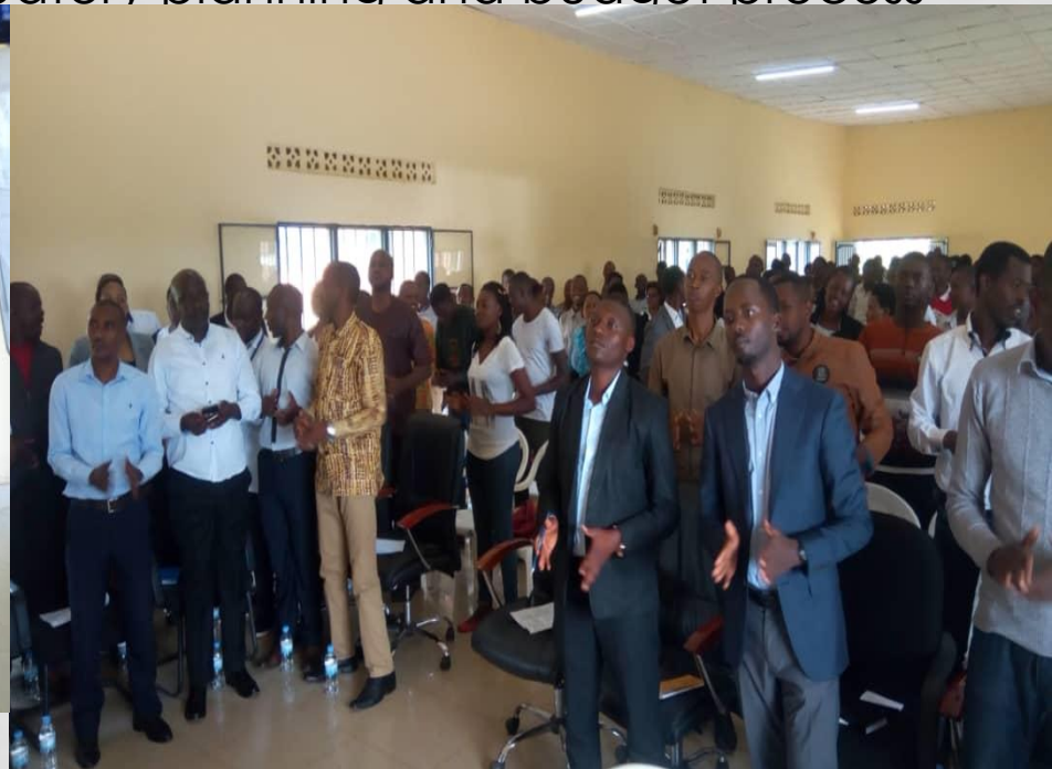
Youth sessions in Bugesera District